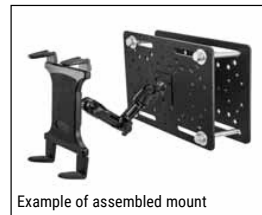
Example of assembled mount

FLTAB106 includes two metal mounting plates for placement on either side of the forklift guard. Use the included 3/8-16 x 4" Tap Bolts with washers and nuts to secure the plates at each corner.