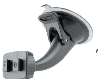
GN015-SBH Travelmount® Mini Windshield Suction Mount