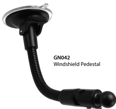
GN042 Windshield Pedestal