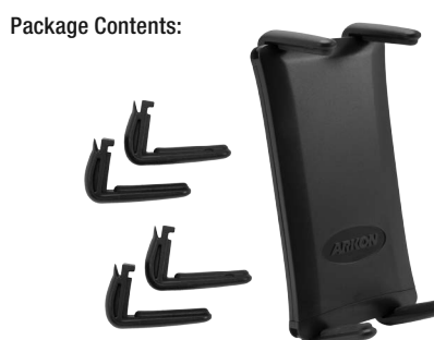
SM060-2 Slim-Grip® Ultra™ Universal Smartphone & Midsize Tablet Holder

IMPORTANT: 4 short and 4 long support legs are included. Select the appropriate short or long support legs and install to holder. For large sized smartphones midsized tablets, select 4 long support legs.