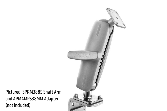
Pictured: SPRM3885 Shaft Arm and APMAMPS38MM Adapter (not included).

Combine with a 38mm ball-compatible Robust Mount Shaft Arm to create a custom clamp mount (components sold separately).