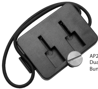
AP2TSTRAP Dual T-Slot to Dual T Tab with Bungee Locking Strap