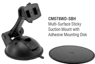
CM078WD-SBH Multi-Surface Sticky Suction Mount with Adhesive Mounting Disk