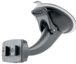
GN015-SBH Travelmount® Mini Windshield Suction Mount