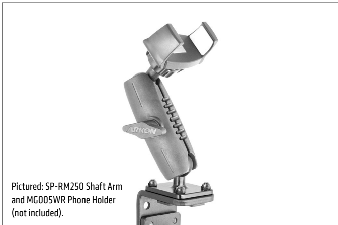
Pictured: SP-RM250 Shaft Arm and MG005WR Phone Holder (not included).

Combine with a 25mm ball-compatible Robust Mount Shaft Arm to create a custom clamp mount (components sold separately).